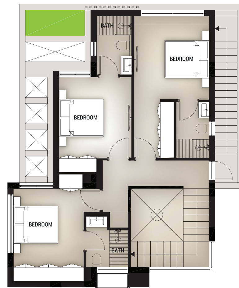
1. First floor